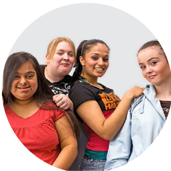
seeing my friends